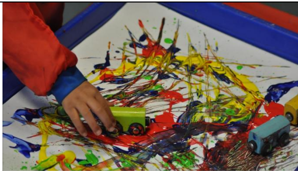
Using trains to make marks

Practice mark making - drawing lines and circles (or forming letters and numbers; for older children) , in sensory materials such as ; flour, salt, sand, shaving foam, with large sticks in mud