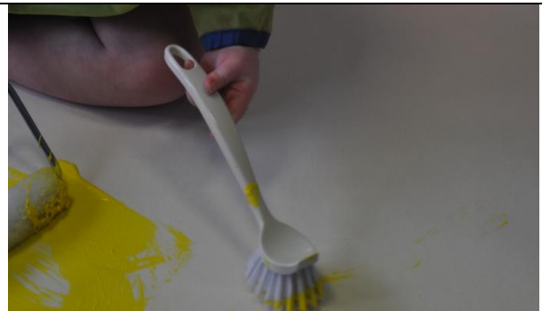
Using a scrubbing brush to make marks