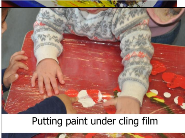
Putting paint under cling film